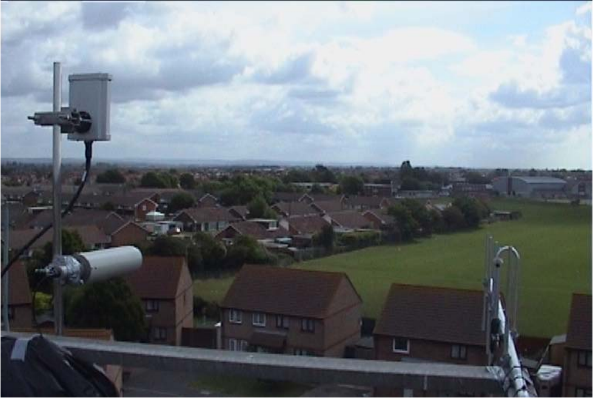
Transmitting antennas for location variability measurements